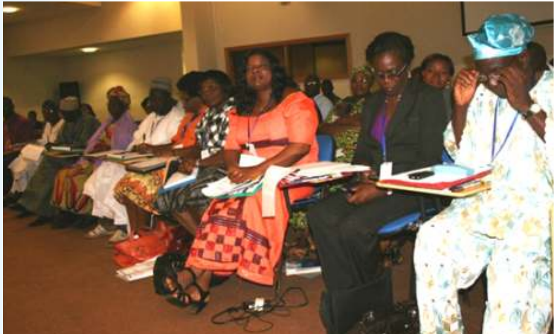
■ Participants at the Conference listen with rapt attention.

Development (DGD) project is a joint initiative from UNDP, the European Union (EU), the UK Department for International Development (DFID), the Canadian International Development Agency (CIDA) and the Korean International Cooperation Agency (KOICA). This project aims at being a driving force in consolidating and embedding democracy in Nigeria over the coming five years. In the forthcoming elections context, and in view of improving the electoral process, the DGD project currently focuses on providing technical and financial support to the Independent National Electoral Commission (INEC), the National Assembly, the Judiciary, political parties, civil society organizations and the media.